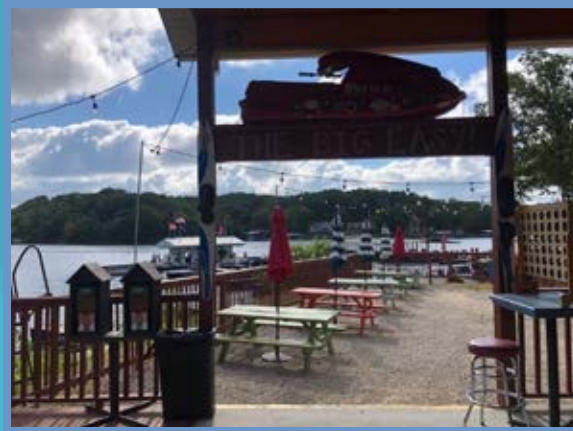
Lake House13 98 Oasis Cir, Sunrise Beach

Our August Happy Hour will be held on the 6th at Lakehouse 13 in Sunrise Beach. It's on the water so boat or drive and join us!